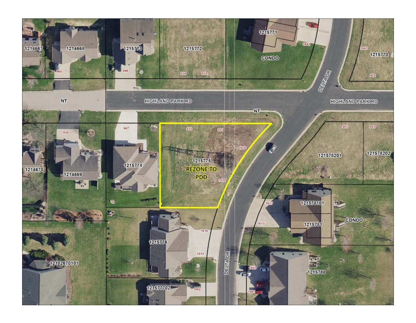
ATTACHMENT 1: Proposed Zoning Map Amendment