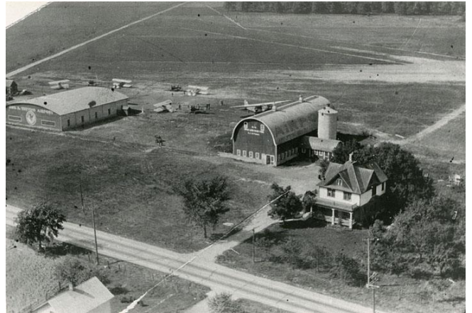
Aerial view along Appleton Rd. - 1930