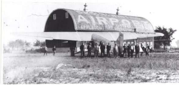
Pride of Appleton plane - 1929

The airport became busier and at one time there were 15 airplanes based out of here. The first airplane delivered was the "Pride of Appleton." The wingspan was so large; it had to be anchored behind the Wittmann family barn. A flight school was based at the airport and in June 1929, the first class graduated consisting of six pilots and four mechanics. Flights from Whiting Airport were increasing with regular flights bound for Milwaukee, Chicago, and the Dakotas.