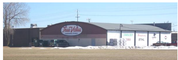
Original hangar, now Kitz & Pfeil - 2005

Today, Kitz & Pfeil Hardware Store stands on the site of the former airport. The hardware store utilizes the old hangar as part of the store. The old hangar is visible as you approach Kitz & Pfeil from the west on Airport Rd.