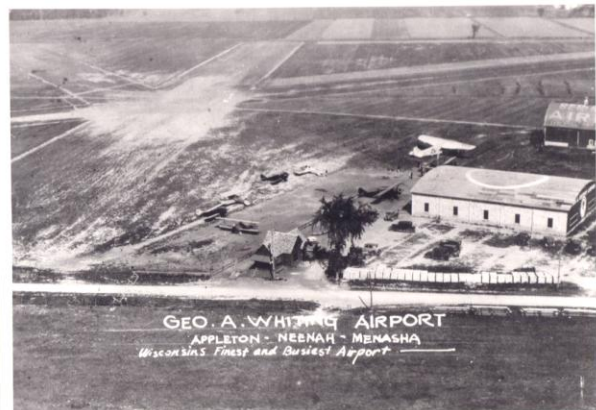
Aerial view along Airport Rd. - 1929

The airport's runways faced all four directions allowing planes to take off and land regardless of wind direction. Originally the runways were left as grass, but were later covered with gravel and cinder. In wintertime, when the snow was too deep, planes were directed to Lake Winnebago where they landed and took off on the lake's frozen surface.