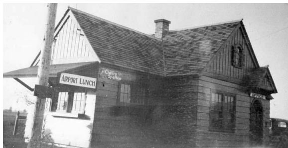
Airport office - 1930

Airmail service slacked in 1930 when the U.S. Government would no longer fund airmail service to private airports. This caused Northwest Airways to pull out of the airport. During this time a lawsuit was filed against the airport by a pilot over damages to his plane. The airport eventually lost this suit. With the lost suit and loss in revenues from the loss of airmail and delivery service, the airport was forced to close. The Fox Valley remained without air service for the next 29 years.